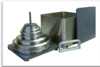
transport metal boxes

(OP0101) : 260 x 260 x 310 mm - weight empty : 6 kg