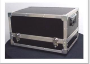
Suitcase for post planning and transportation

(OP0095) small : 280 x 250 x 280 mm weight empty : 5 kg