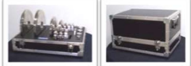
Suitcase for post planning and transportation (OP0095) small : 280 x 250 x 280 mm - weight empty : 5 kg (OP0099) large : 500 x 350 x 280 mm - weight empty : 11 kg