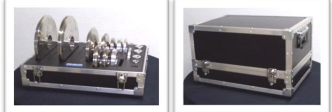
Suitcase for post planning and transportation (OP0095) small : 280 x 250 x 280 mm - weight empty : 5 kg (OP0099) large : 500 x 350 x 280 mm - weight empty : 11 kg