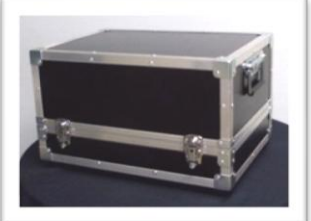
transport metal boxes

(OP0101) : 260 x 260 x 310 mm - weight empty : 6 kg