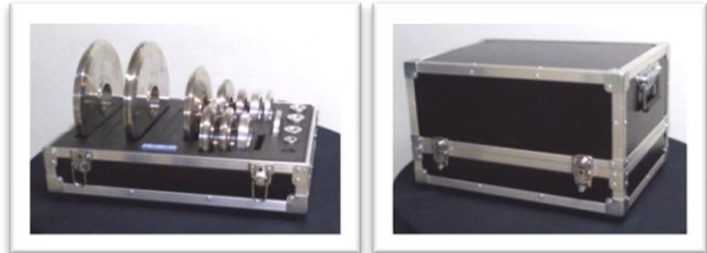
Suitcase for post planning and shipping

(OP0101) : 260 x 260 x 310 mm - weight empty : 6 kg