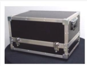
Suitcase for post planning and shipping

(OP0095) small : 280 x 250 x 280 mm - weight empty : 5 kg