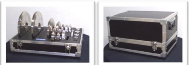
Suitcase for post planning and shipping

(OP0101) : 260 x 260 x 310 mm - weight empty : 6 kg